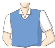
Collared Shirt and Vest